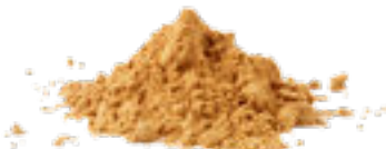
WHEAT GERM SOURDOUGH A sourdough* that provides savoury notes • Notes: savoury, grilled cheese Code 04835 / 5kg / 12 months

Recommended dosage: 0,5 % à 5 %. Conditioning: 5 kg. Use: for special breads and fine bakery products 1 .