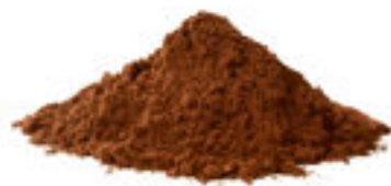
MALTROAST 1300 Dark malt • Intense dark brown color Code MV066 / 5 kg / 12 months

Natural food products, 100% clean label. Malts offer unique visual signatures to the crust and crumb of your products. Ideal for bringing a unique note to your product by softening its color. Recommended dosage: 0.2% to 5%.