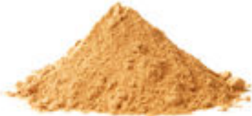
MALTROAST 200 Light malt • Warm caramel brown color Code MV067 / 5 kg / 12 months